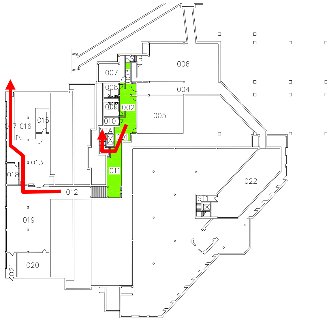
Blazer 1 st Floor

Location of Evacuation Rally Point is the Mall Area