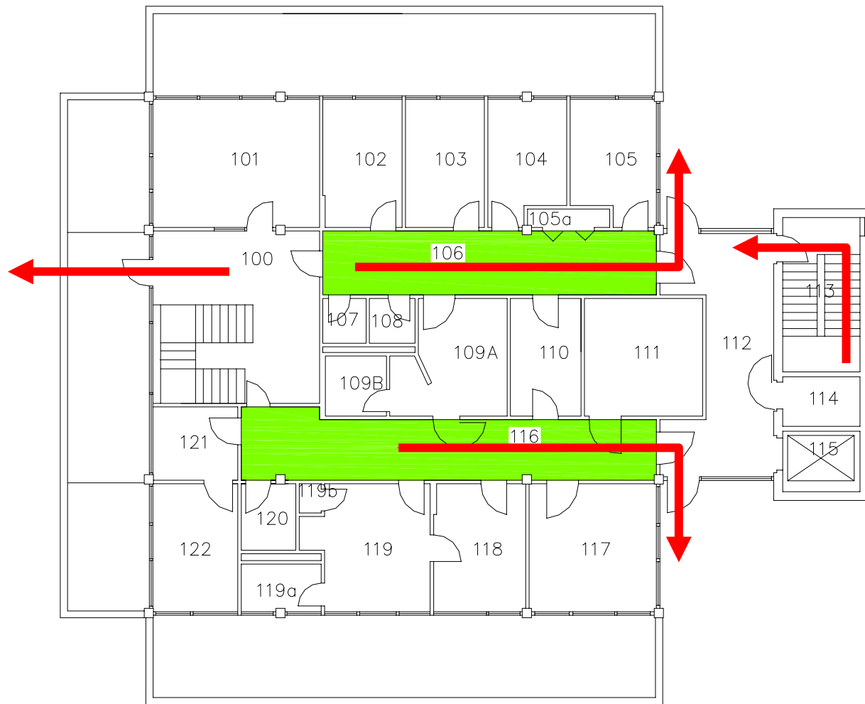
Betty White 1 st Floor

Evacuation Rally Point is the Front Lawn