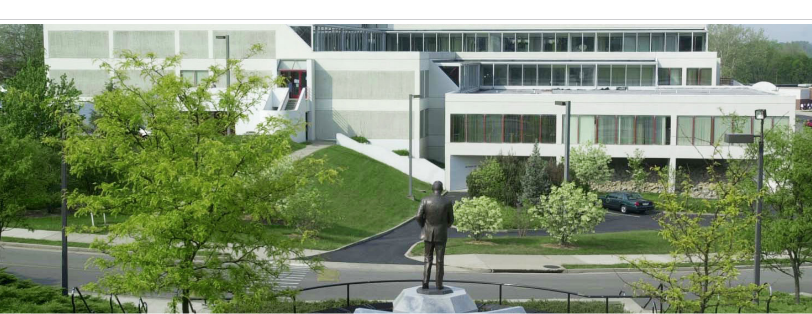
Kentucky State University is an Equal Opportunity/Affirmative Action employer and educational institution and does not discriminate on the basis of age (40 and over), color, creed, disability, ethnicity, gender expression, gender identity, marital status, national origin, political belief, pregnancy, race, religion, sex, sexual orientation, or veteran status in the admission to, or participation in, any educational program or activity (e.g., athletics, academics and housing) which it conducts, or in any employment policy or practice.